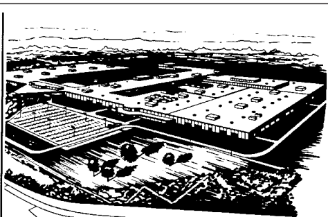
NISSAN MANUFACTURING FACILITY in Smyrna, Tennessee